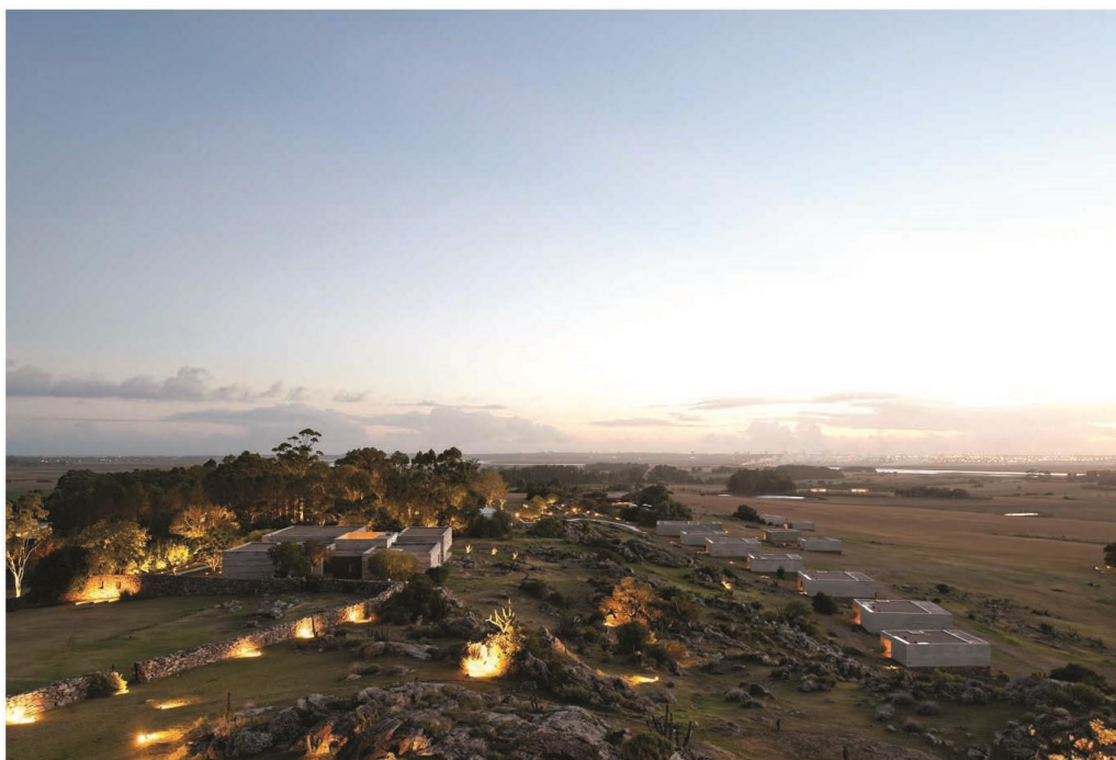
Fasano Punta del Este and (opposite) a criollo horse at Estancia Vik.

IF YOU'RE VISITING URUGUAY from the Northern Hemisphere, you'll notice the moon appears upside down. Instead of spotting a "man" on its face, you might see a rabbit. The stars look different too. You won't find the Big Dipper, but you get the Southern Cross and the trio of sunlike orbs known as Alpha Centauri.