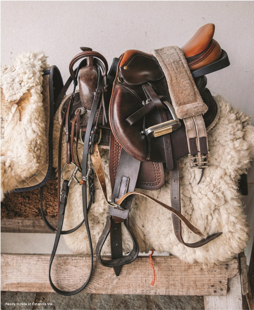
Ready to ride at Estancia Vik.

On the trail for the delightfully laid-back, unsung Uruguay.